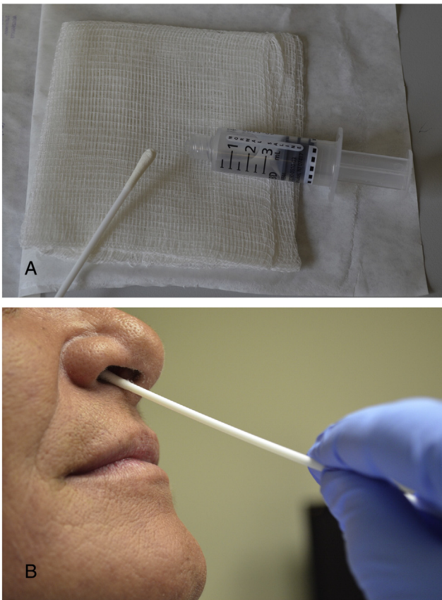
Fig. 1. Nasal swabbing technique, where (A) a saline moistened swab is (B) inserted into both nares and rubbed on the septum.

Maryland) rubbed up the septum five times in both nares (Fig. 1). The screening was performed by medical assistants specifically trained to perform nares swab in the technique described. Each swab was sent to the microbiology lab and was inoculated onto CHROMagar MRSA and CHROMagar SA plates (BD Microbiology Systems, Sparks, MD), and incubated for 20–28 hours at 35–37°C. Cultures that grew on CHROMagar SA plates were MSSA colonized, while CHROMagar MRSA plates were MRSA colonized. Negative cultures were further incubated for 24 hours. After 48 hours, S. aureus positive mauve cultures were verified by Gram stain and coagulase testing (Staphaurex, Remel, Lenexa, Kansas). Colonies growing on both plates were MRSA, while the colonies only growing on SA plates were MSSA.