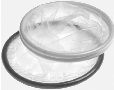
Fig. 1. Alexis, a polyurethane wound retractor manufactured by Applied Medical, is reported to protect wounds.